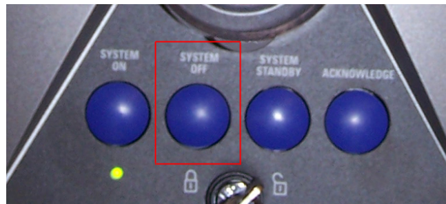
SYSTEM OFF button